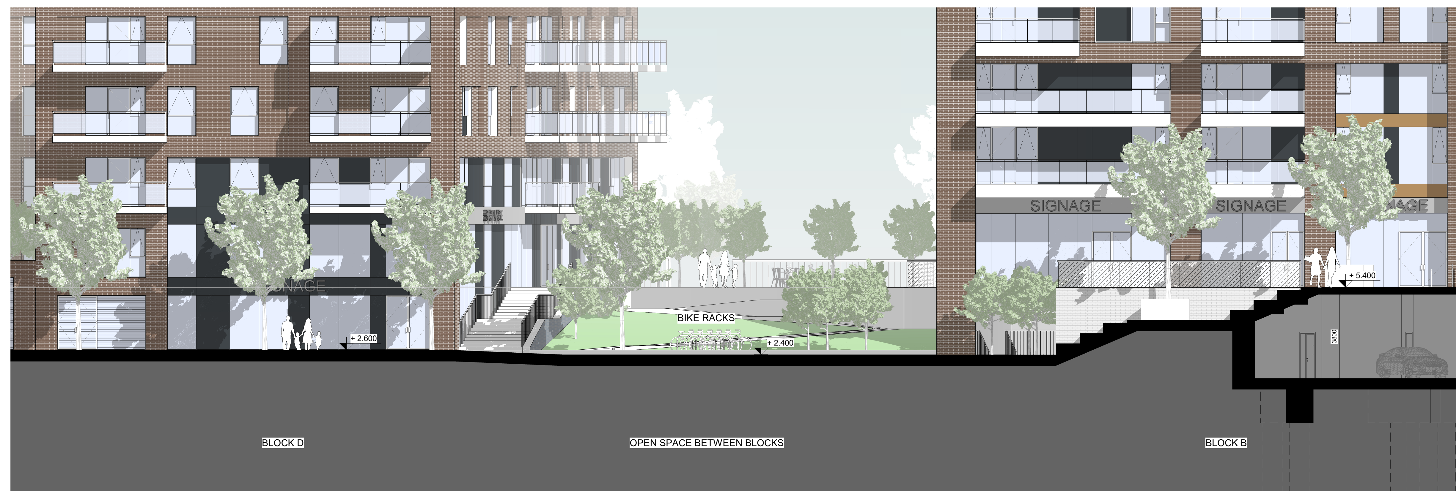
3 CONTEXTUAL SITE SECTION B-B - DEATAIL 1: 100

THE COPYRIGHT OF THIS DRAWING IS VESTED WITH CW O'BRIEN ARCHITECTS LIMITED AND MUST NOT BE COPIED OR REPRODUCED WITHOUT THE CONSENT OF THE COMPANY. FIGURED DIMENSIONS ONLY TO BE TAKEN FROM THIS DRAWING. DO NOT SCALE. ALL CONTRACTORS MUST VISIT THE SITE AND BE RESPONSIBLE FOR CHECKING ALL SETTING OUT DIMENSIONS AND NOTIFYING THE ARCHITECT OF ANY DISCREPANCIES PRIOR TO ANY MANUFACTURE OR CONSTRUCTION WORK.