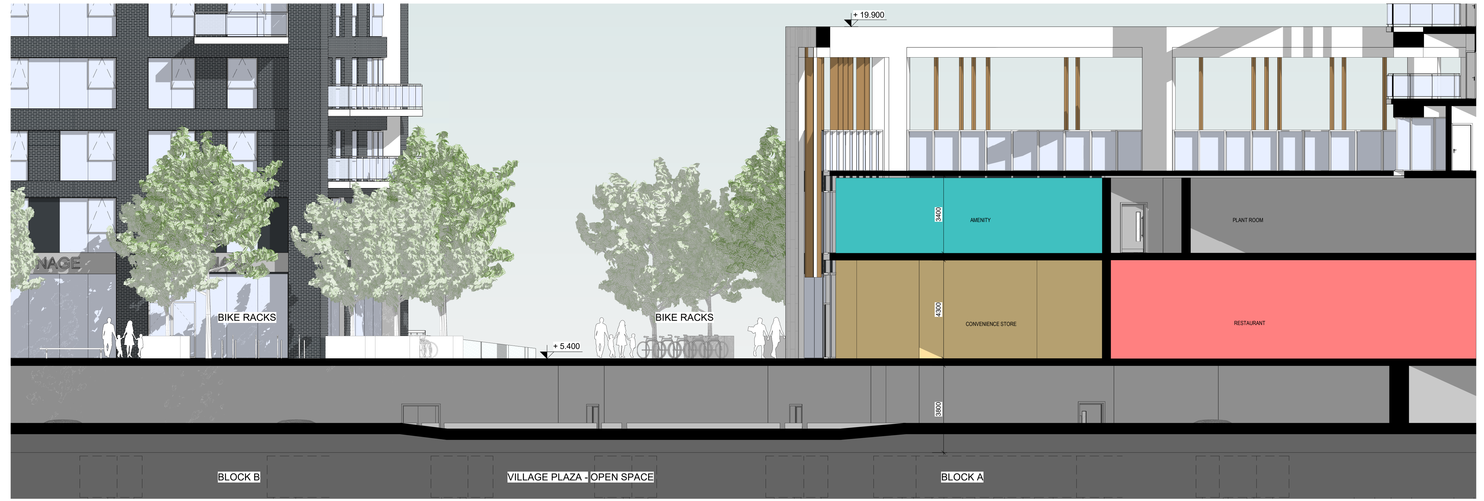
2 CONTEXTUAL SITE SECTION B-B - DEATAIL 1: 100